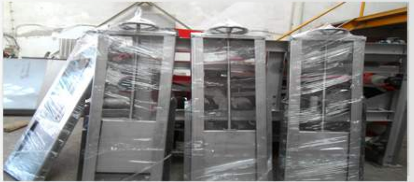
All of the dimensions are custom desing.