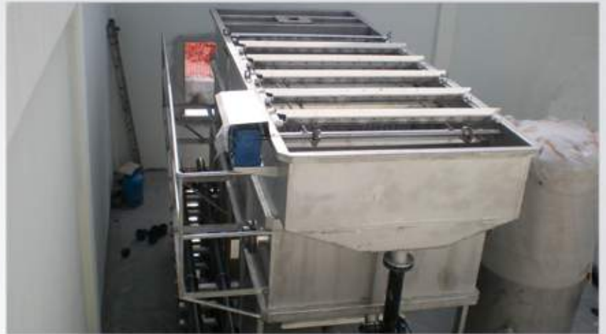
DAF equipment is an all-in-one equipments with DAF tank, surface scraper, DAF pressure tank and high pressure pump.

By help of a scraper floating surface phase collected to sludge part of the tank and treated water goes on to outlet of the tank.