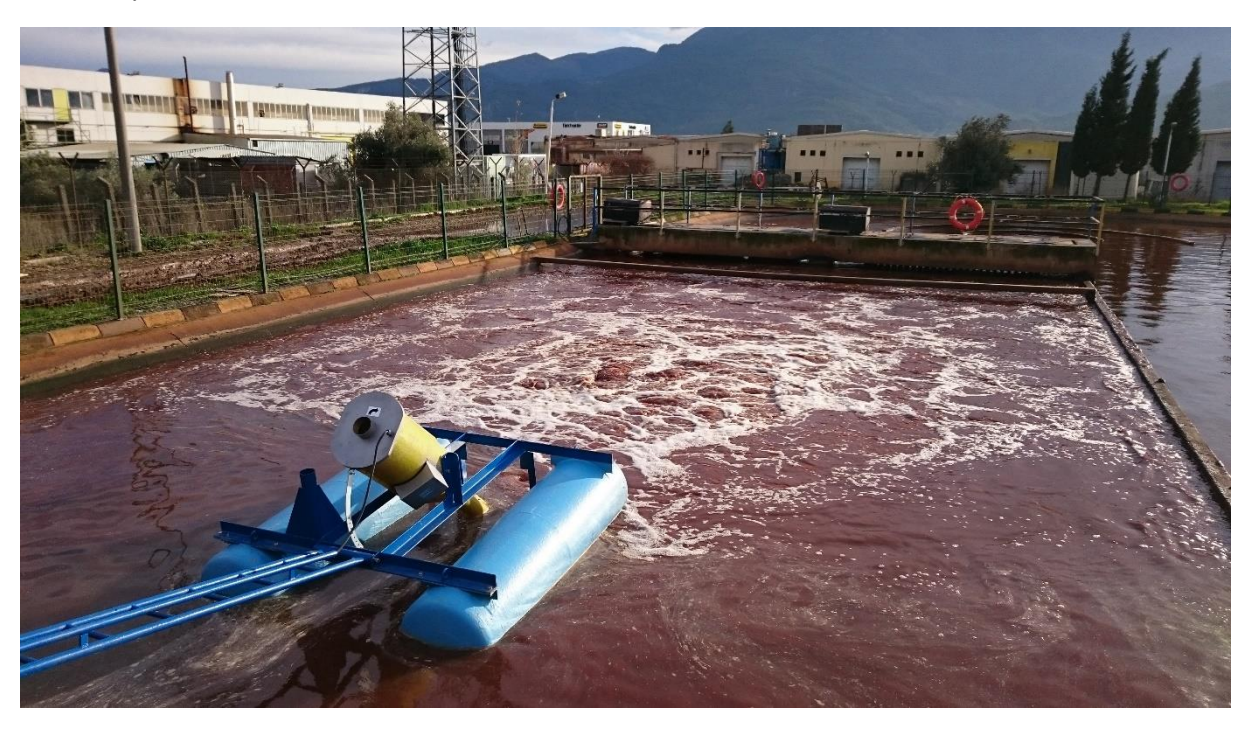
It is ready to start.

16- Finally control the direction of motor rotation.